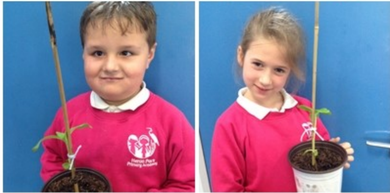
Year 2 Sunflowers

Wonderful things have been happening around school this term.