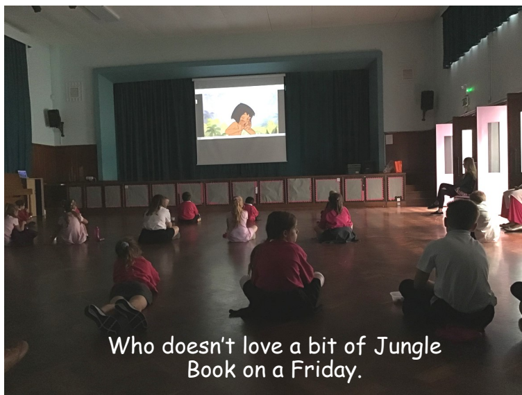
Who doesn't love a bit of Jungle Book on a Friday.