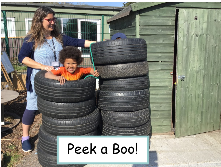
Peek a Boo!

https://www.gov.uk/government/publications/coronavirus-covid-19-keeping-children-safe-online/coronavirus-covid-19-support-for-parents-and-carers-to-keep-children-safe-online