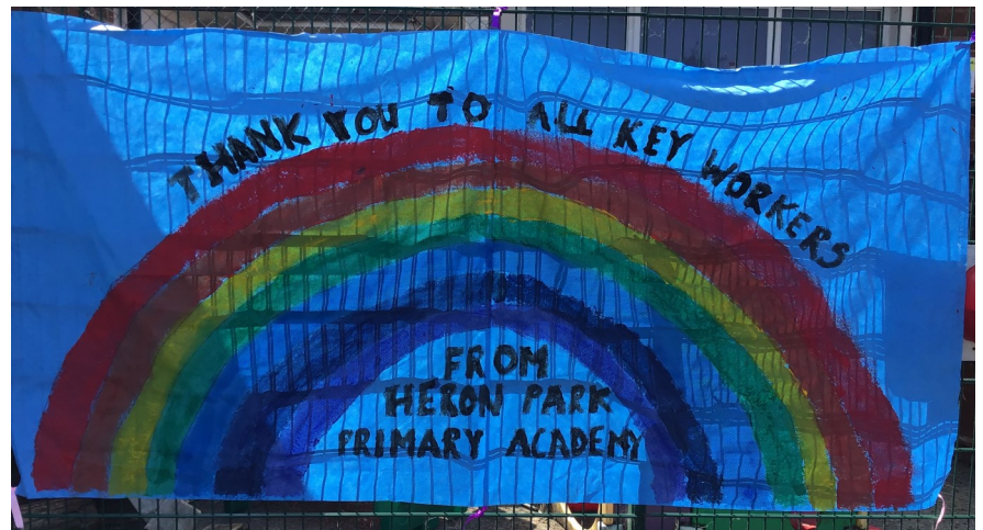
Our Seagull class has had fun making this fabulous sign to thank all Keyworkers.